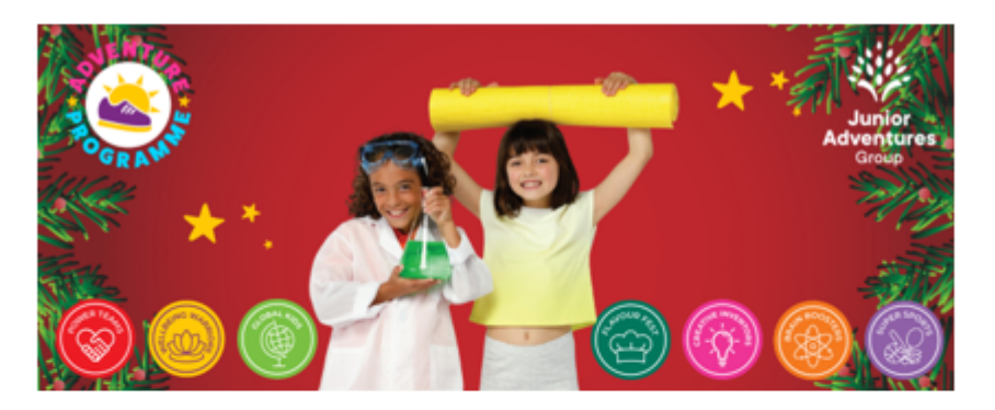
🋕 Join us for festive fun & activities this December at JAG! 😇

As December arrives, our wraparound clubs are gearing up to bring festive sparkle to your child's days. Every day will shine with seasonal games, activities, and crafts from our Adventure Programme , giving every child the chance to celebrate, create, and explore.