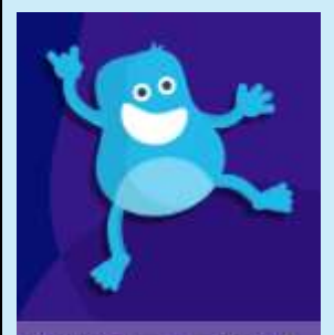
Meet Ollee – a virtual friend

Ollee is a digital friend for children aged 8-11, created by Parent Zone and funded by BBC Children in Need's A Million and Me initiative, which aims to make a difference to children's emotional wellbeing.